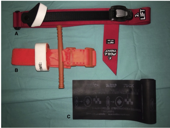
Figure 1. Study tourniquets used. (A) Ratcheting Medical Tourniquet (RMT); (B) Combat Application Tourniquet (CAT); (C) Stretch Wrap and Tuck Tourniquet (SWAT-T).